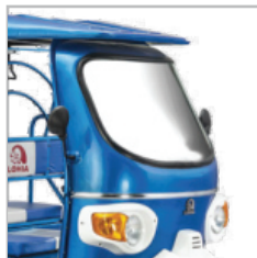
Sheet Metal Roof Top