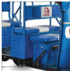
Heavy Duty Chassis