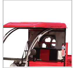
Hard Roof Top