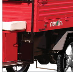
Heavy Duty Chassis